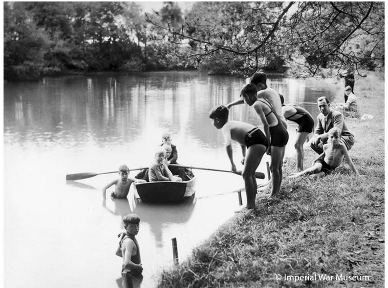
Evacuees from London in Pembrokeshire, Wales, 1940.

Read their stories and answer the questions.