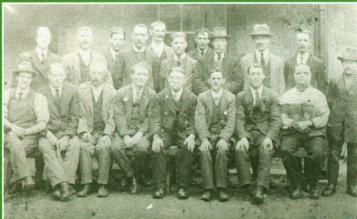
Gas street lamp lighters outside their Womanby Street depot.

"I remember the lamplighters coming along in the evening. The lamp was right outside our house. I was around eight then. We used to use the lamp post as a swing, with the arms, we'd put a piece of rope over. When the chap (lamp lighter) used to come around, if the rope was still there he would give us stick! However, as soon as he was gone, we'd be back out there."